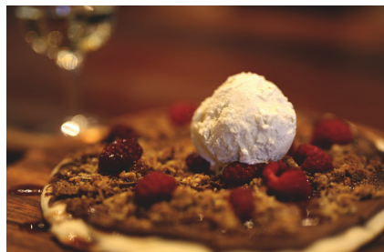
Raspberry & Nutella pizza

Bremerton is and always has been a family affair. Our child friendly facilities mean you can relax with a glass of wine while the kids investigate the toy box. For the littlies, our kid zone is packed full of games, colouring in activities and toys while for the big kids, let them loose on the lush lawns to kick around the balls or play croquet. Our kids menu means the whole family can stay for lunch. The kids' pizza options are a favourite. So don't leave the kids cooped up at home, get some quality family time whilst doing what you love!